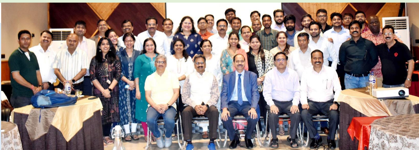
The annual HR Meet was organised from 5 th to 7 th March at Sunderbans.