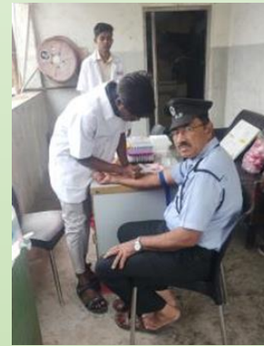
Medical camp at Manali Complex, Chennai