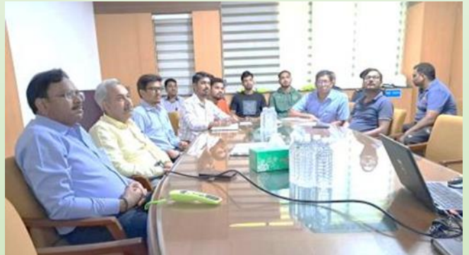
IP, Taloja organised Behavior Based training program conducted by experts for the employees