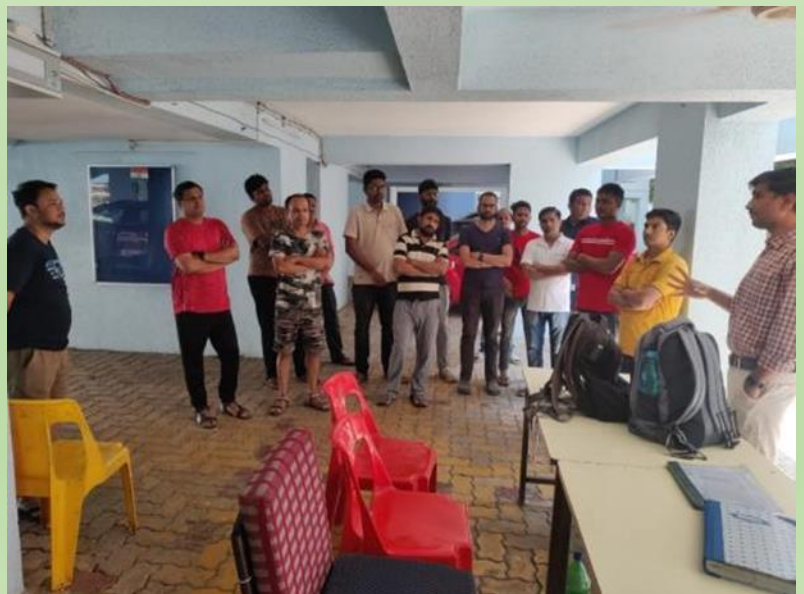
Safety training program conducted at Nerul housing complex and Balmer Lawrie's Mumbai Office