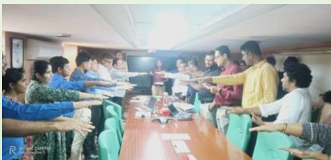
Administration of Safety Pledge at Delhi and Mumbai Offices