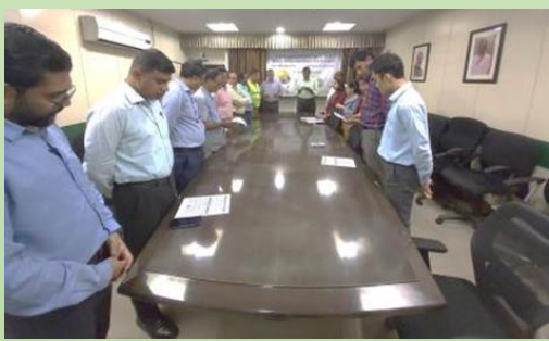
Administration of Safety Pledge at CFS, Chennai and Kolkata