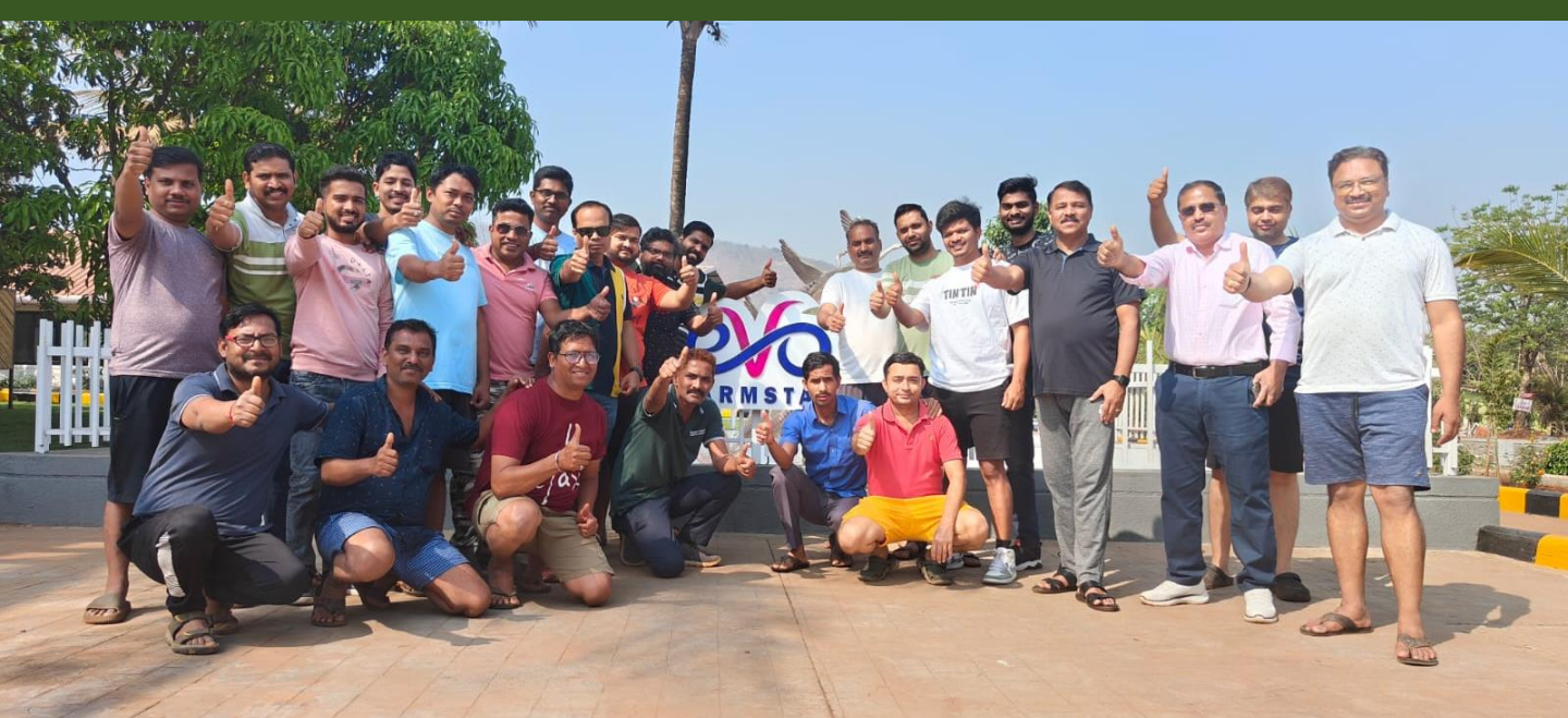
As a part of employee engagement, a one day get together was organised in the EVO Farmstay at Karjat on 16 th March 2024 for the employees of Industrial Packaging – Navi Mumbai.