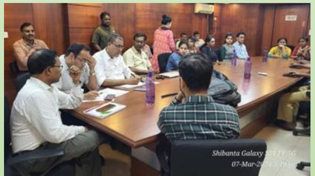
Extempore Competition at the Corporate Office in Kolkata and HRC, Kolkata