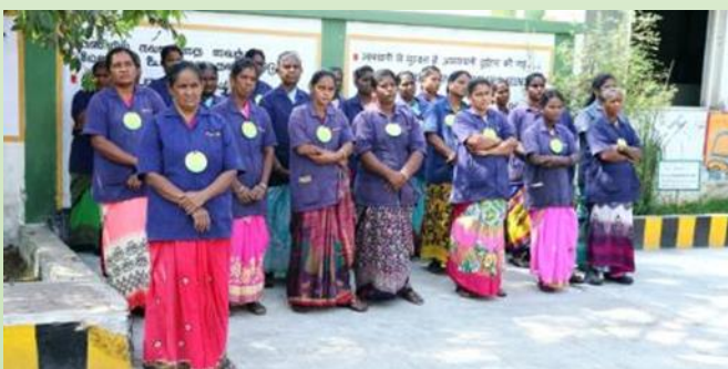
Administration of Safety Pledge at Manali Complex, Chennai