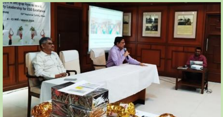
Safety Week closing ceremony at Corporate Office, Kolkata