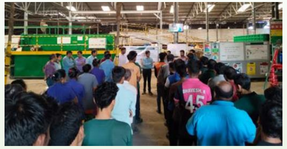
Administration of Safety Pledge at Cold Chain, Hyderabad and IP, Silvassa