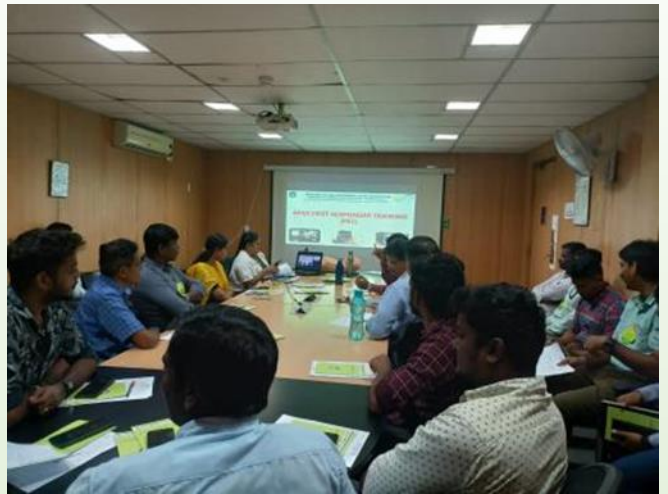
Manali Complex, Chennai organised a First Aid training program