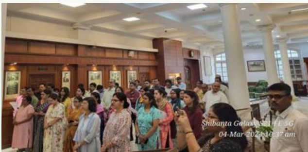
Inauguration of 53 rd National Safety Week at the Corporate Office in Kolkata and administration of safety pledge