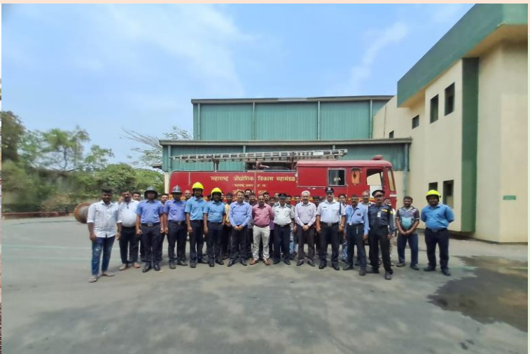
On 29 th March 2024, a mock drill on firefighting and a training session on how to use fire hydrant system safely was organised at Industrial Packaging – Navi Mumbai by the Fire Officer, MIDC Fire Station, Taloja.