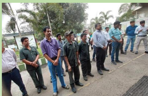
Administration of Safety Pledge at CFS, Navi Mumbai and G&L, Kolkata