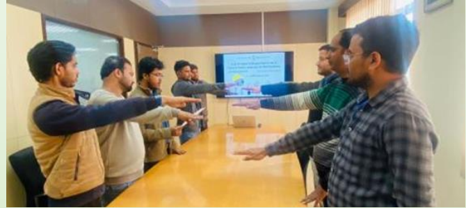
Administration of Safety Pledge at IP, Taloja and Cold Chain, Rai