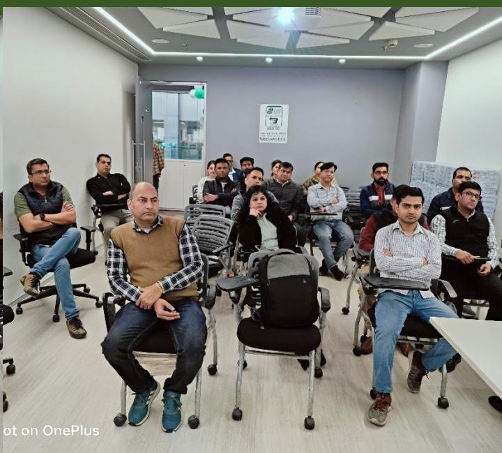
A training session on the GIT Products of Vacations was organised for the implant staff of Travel, Delhi in the Northern Region Office at Okhla, New Delhi on 24 th February 2024. A total number of 18 participants attended the training program. The Vacations team trained the implant staff of Travel, Delhi.