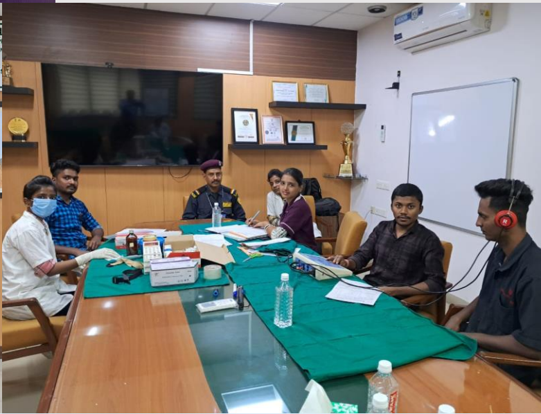
The annual Health Check-up for all the employees was conducted on 1 st February 2024 at Industrial Packaging, Navi Mumbai.