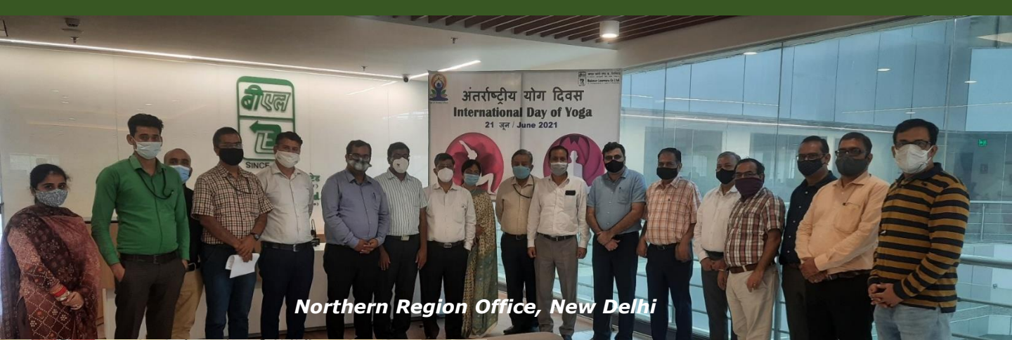
Northern Region Office, New Delhi