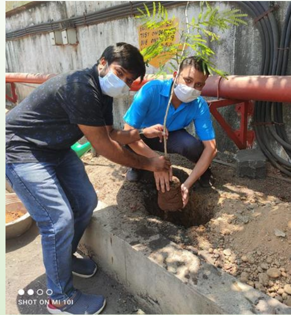
CFS - Chennai