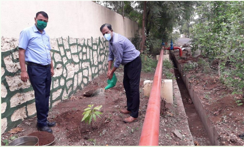
IP – Navi Mumbai