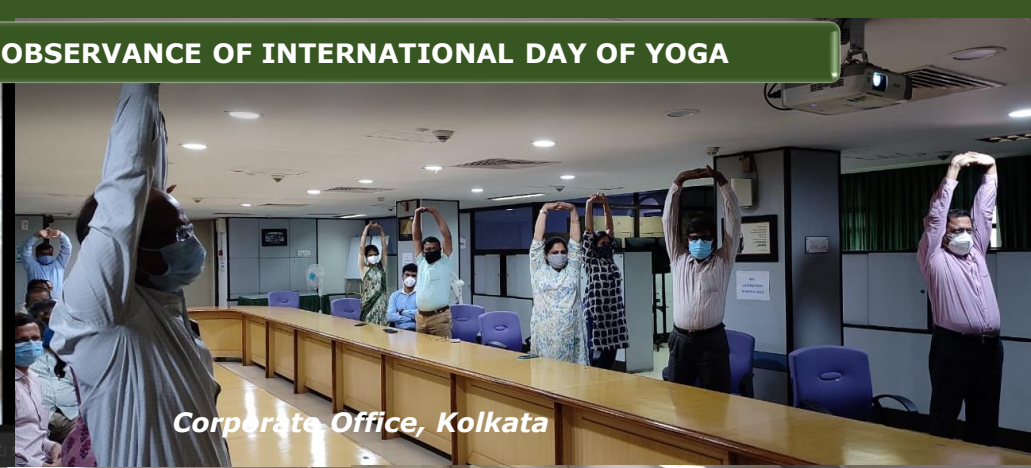
Corporate Office, Kolkata