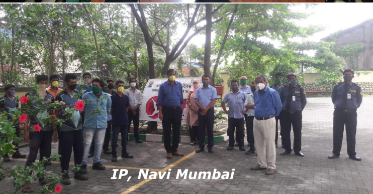
IP, Navi Mumbai