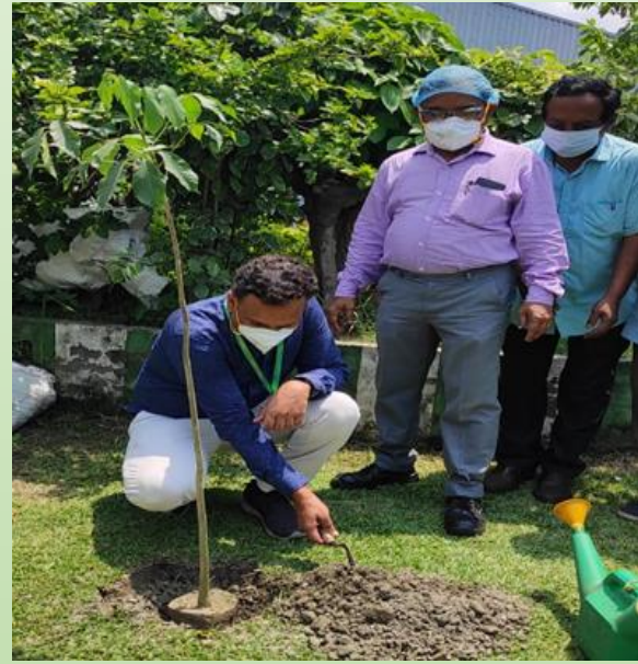
G&L - Kolkata