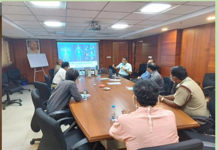
A Safety Training session on 'Ergonomics in Workplace' was conducted at G&L - Kolkata on 25 th June 2021.