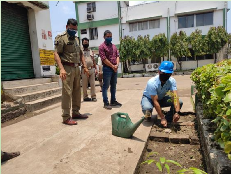
CFS - Kolkata