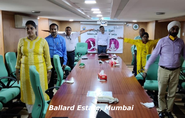
Ballard Estate, Mumbai