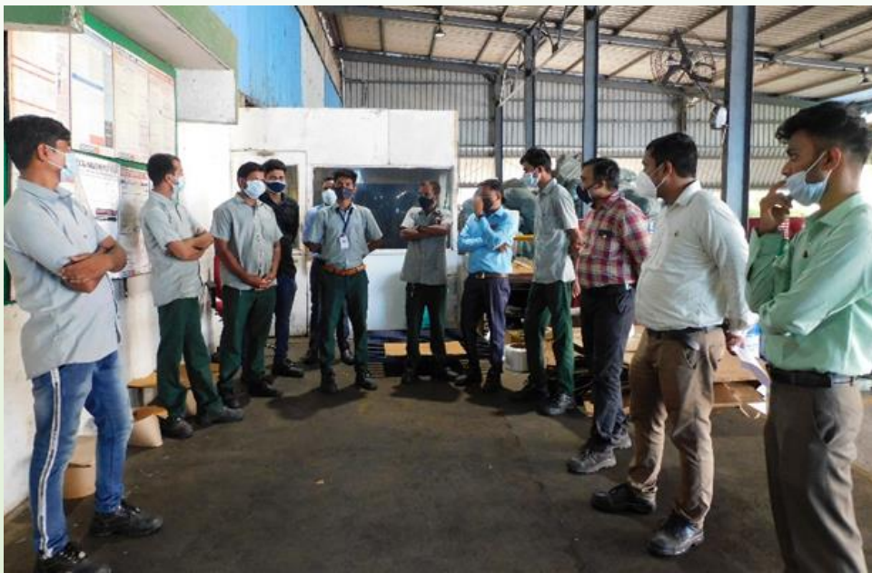
A training program on Forklift Operation and Safety was organised at G&L - Silvassa on 11 th June 2021.