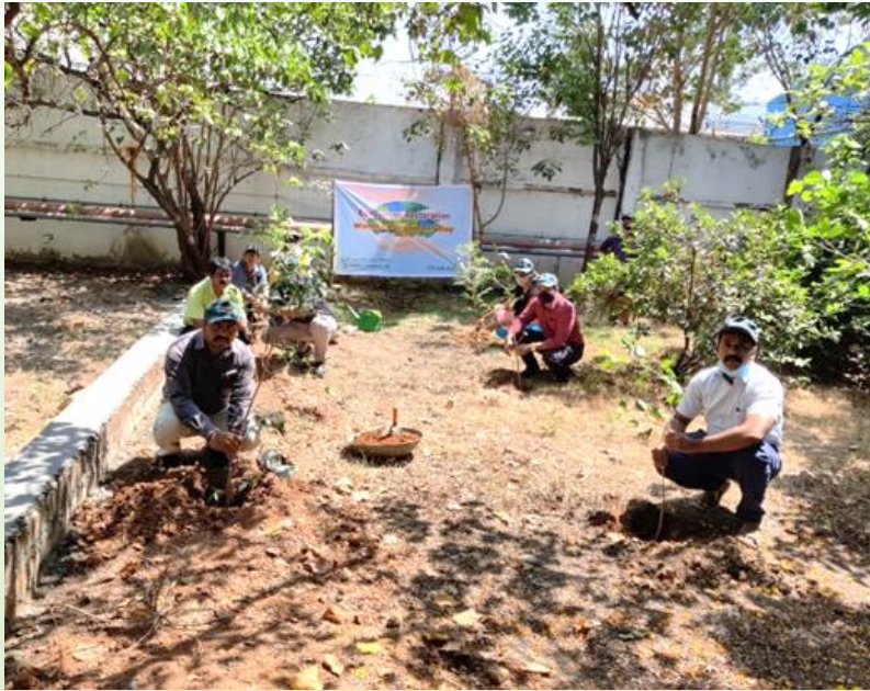
Manali complex, Chennai