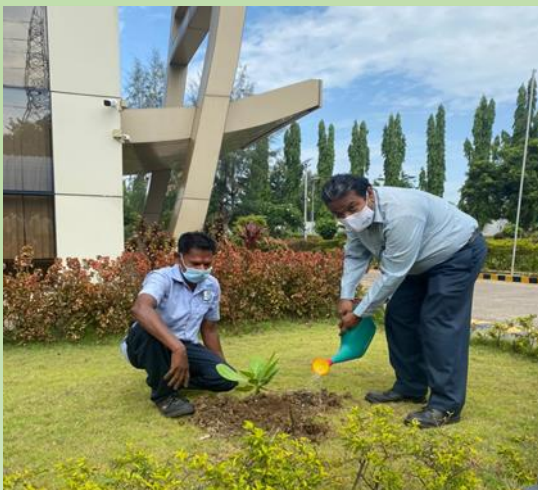
G&L - Silvassa