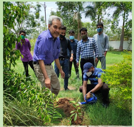
IP - Vadodara