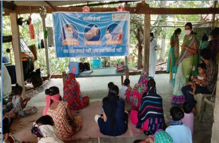
Awareness programs were organized for Aanganwadis / Government school children and communities residing in an around our factories in Silvassa (Sayli and Khadoli village) and Taloja (Padghe village). Mask and sanitizers were distributed to Government school students, Aanganwadi workers and villagers. Housekeeping team from Panvel Municipal Corporation was deputed at Padghe village to be part of the campaign.