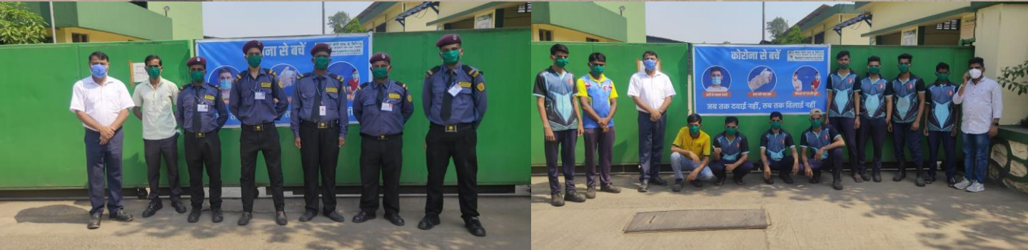
At Industrial Packaging, Navi Mumbai, banners were displayed on all the trucks operating in and out of the factory premises. Sanitizer bottles and masks were distributed to truck drivers, housekeeping and security personnel on 31 st October 2020.