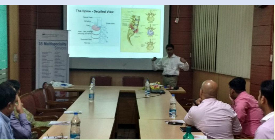
A health awareness program on 'Heart Attack and Cardio Pulmonary Resuscitation (CPR)' was organised by Regional HR - East in association with B M Birla Heart Research Centre, Kolkata on 5 th April 2018 at the Balmer Lawrie Training Centre, Kolkata. Around 35 employees participated the program.

The Spine - Detailed View Labels: Cervical vertebrae, Thoracic vertebrae, Lumbar vertebrae, Sacrum, Coccyx, Intervertebral discs, Spinal cord, Nerve roots, Vertebral foramen, Spinous process, Transverse process, Pedicle, Lamina, Vertebral body, Intertransverse space, Superior articular process, Inferior articular process, Sacral hiatus, Sacral canal, Sacral foramina, Sacral cornua, Sacral promontory, Sacral hiatus, Sacral canal, Sacral foramina, Sacral cornua, Sacral promontory.