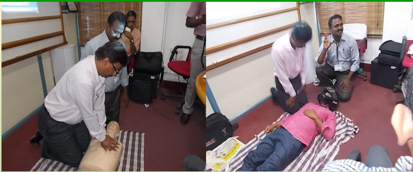
First Aid Training at CFS, Chennai