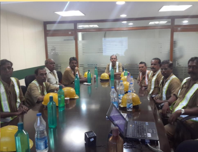
HSE Training at CFS, Kolkata on Crane Inspection