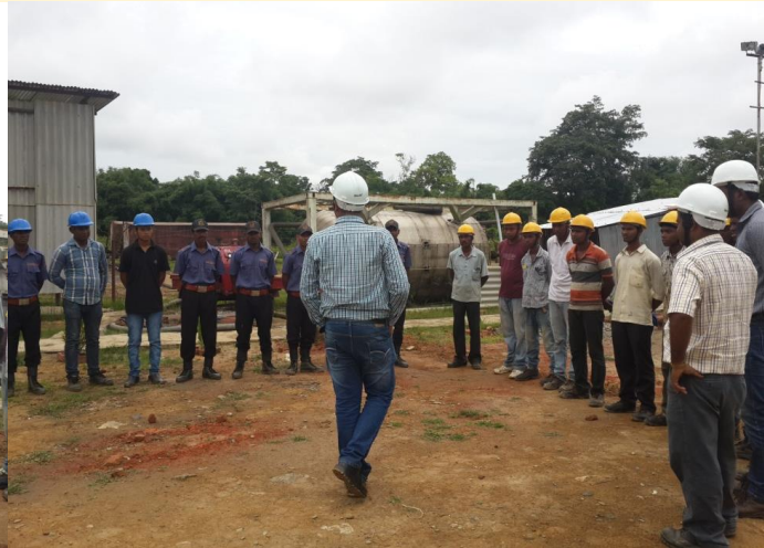
HSE Training on Safety Dos & Don'ts at ROFS Dicom Site