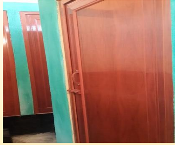
Kumar Ashutosh Institution for Girls