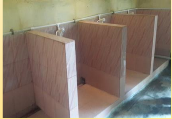
Gopeswar Dutta Free School